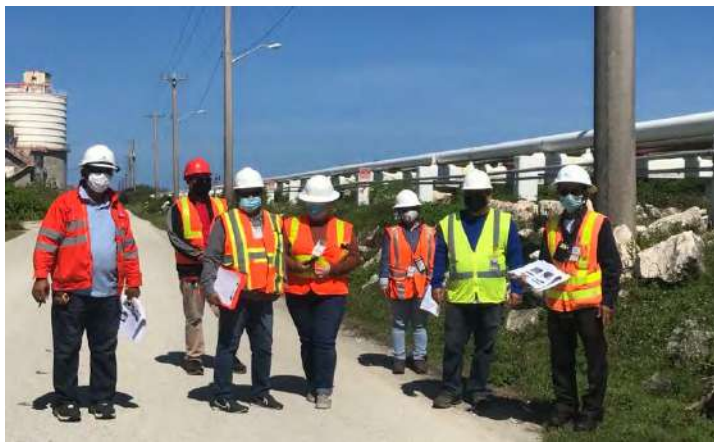
Procurement and Engineering staff conducted a mandatory pre-bid site visit on April 23, 2021 for RFQ-PAG-021-009-CIP Spot Corrosion Removal/Repair of Mobil Pipeline Maintenance. Potential bidders were able to see the project site which is located inside Mobil Golf Pier Yard, extending along Rt. 11, Cabras Island and ending at the Y-Junction station.