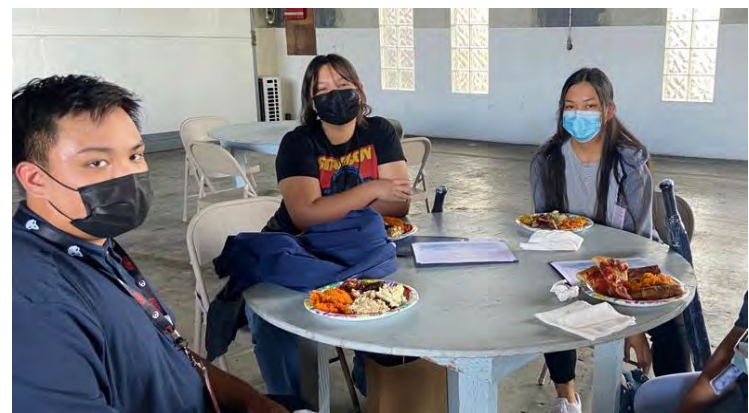
the U.S. Department of Education, American Rescue Plan to the Outlying Areas, State Educational Agency (ARP-OA SEA).