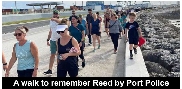
A walk to remember Reed by Port Police