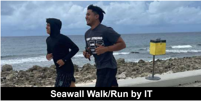
Seawall Walk/Run by IT