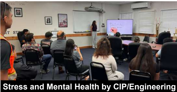
Stress and Mental Health by CIP/Engineering