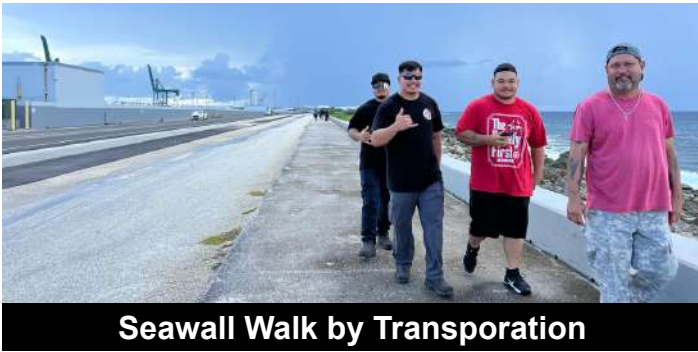
Seawall Walk by Transportation