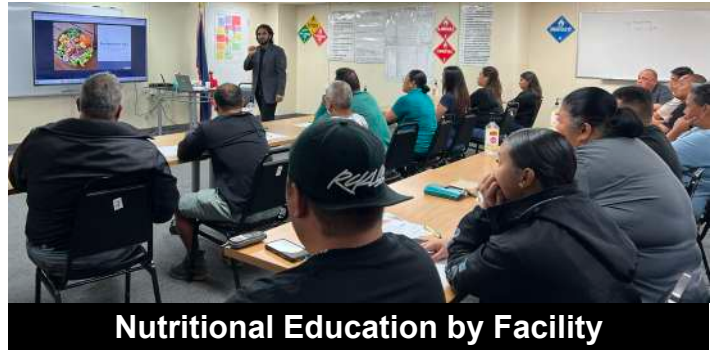
Nutritional Education by Facility