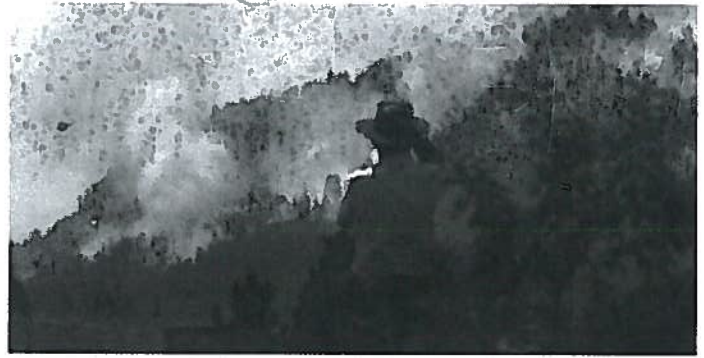
KELOWNA: A local resident watches a forest fire burning on the edge of Kelowna, British Columbia, at dawn on July 19, 2009.

Burns was introduced at the hearing by bipartisan foreign policy heavyweights - former Secretary of State James Baker and former CIA director and Secretary of Defense Leon Panetta. He would be the first career diplomat to lead the agency.