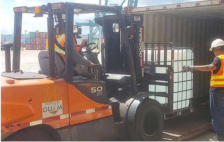
FEMA Hand Sanitizer Devanning1: Port Authority of Guam employees recently off load drums of hand sanitizer for storage and distribution at clinics, hospitals and government agencies on Guam.

operation from the very beginning of this pandemic. That speaks to the Port Strong spirit of the employees and our commitment to everyone on our island.” The drums full of hand sanitizer were donated from FEMA to Guam Homeland Security. GHS designated the Port Authority of Guam to be in charge of this project and the drums are stored at the Port’s main facility. PAG personnel coordinate the delivery of the hand sanitizers to locations around the island at the direction of Homeland Security.