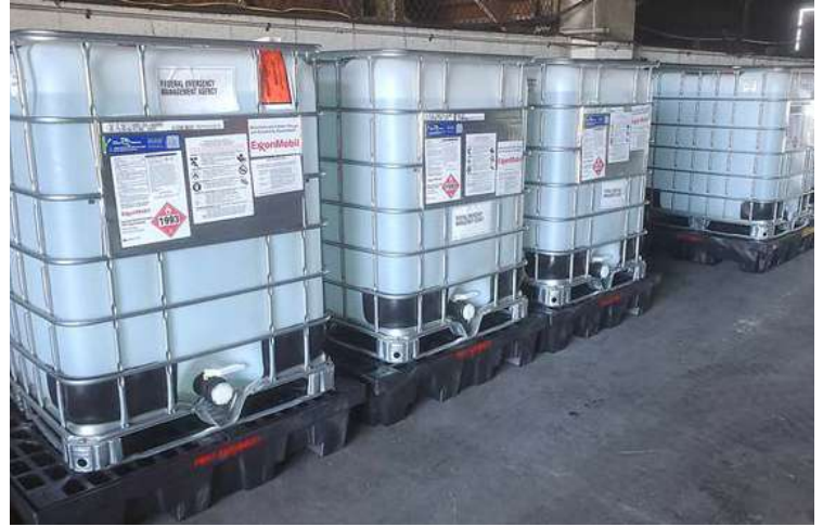
FEMA Hand Sanitizer Devanning2: Drums of hand sanitizers are stored at the Port Authority of Guam for use across the island and to be distributed by Port Authority of Guam.