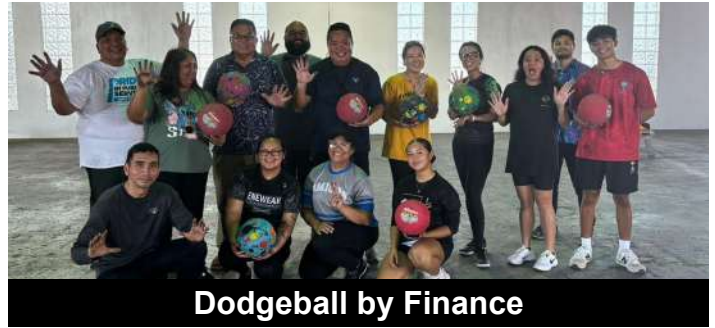
Dodgeball by Finance