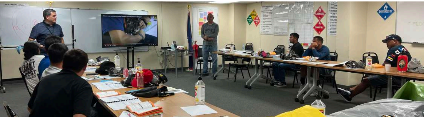
Port employees attend the Hazardous Waste Operations and Emergency Response (HAZWOPER) 40-hour training from July 15-19, 2024. The HAZWOPER training course is a set of guidelines produced and maintained by the Occupational Safety and Health Administration which regulates hazardous waste operations and emergency services in the United States and its territories.