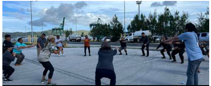
Freestyle by Commercial