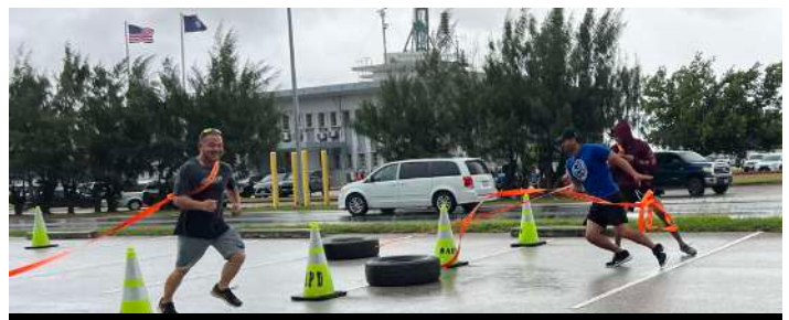
Tire Exercises by Stevedores