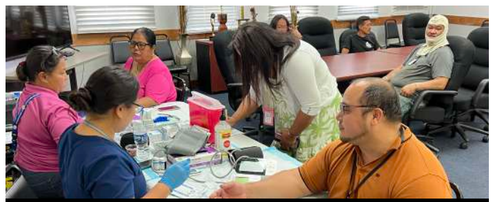
Health Screening by Marketing